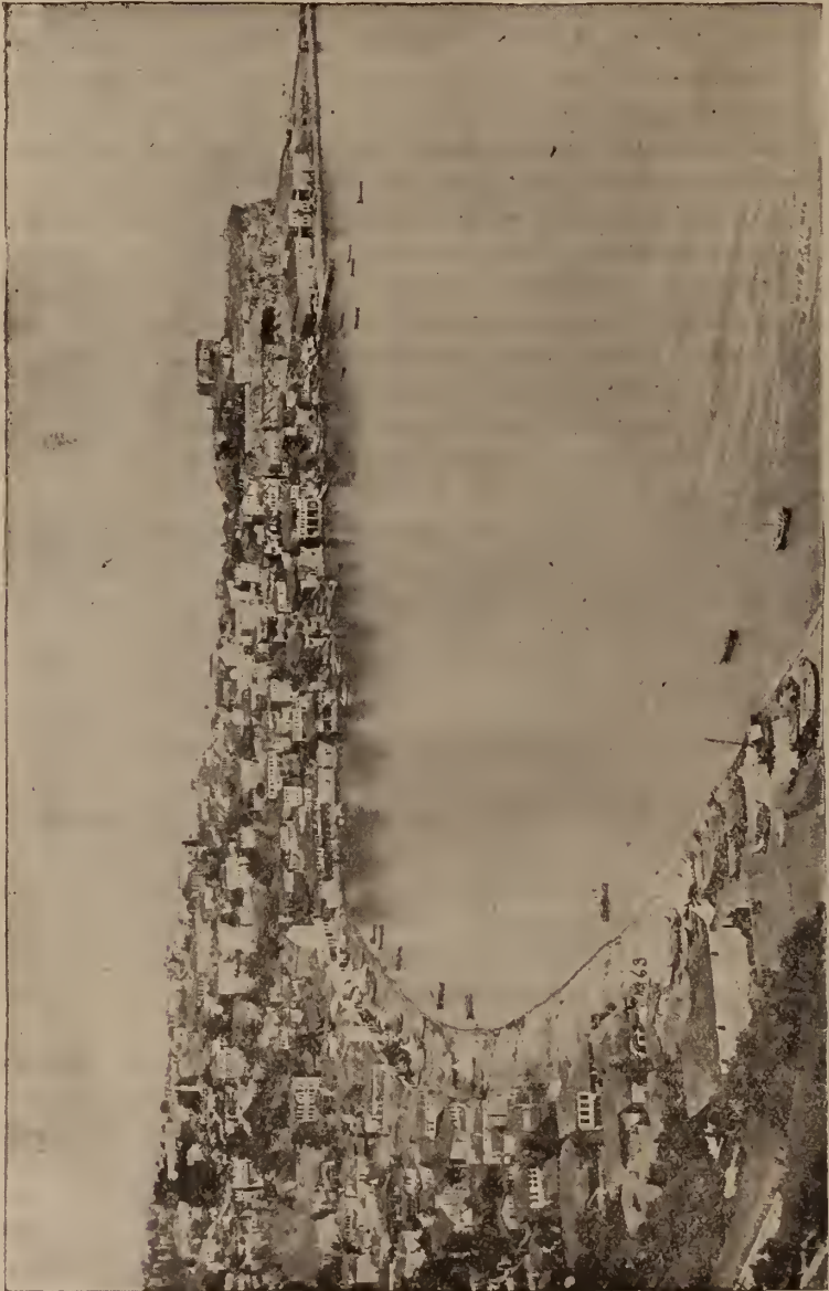
A SECTION OF TREBIZOND, NEAR THE SEA.

coming forward at Ordoo and other points ; and though previously the interest had been chiefly among Armenians, Greeks were now beginning to seek after the truth. It was deemed advisable, therefore, to reorganize the Trebizond station,